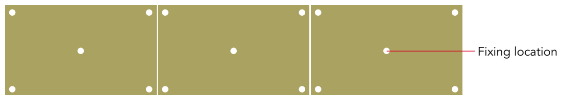
Figure 2 Second layer

Per board: one centrally located fixing, and four located 100-150mm diagonally from each corner. Note: Number of fixings required may increase subject to project-specific wind load calculations.