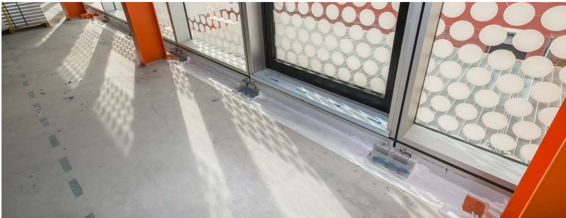
SoftSeal installed as a linear joint seal

*Linear Joints over 300mm wide can be accommodated, with the addition of steel Z brackets. For further information and advice on sizes or applications, please contact Rockwool Technical Solutions Team on 01656 862621.