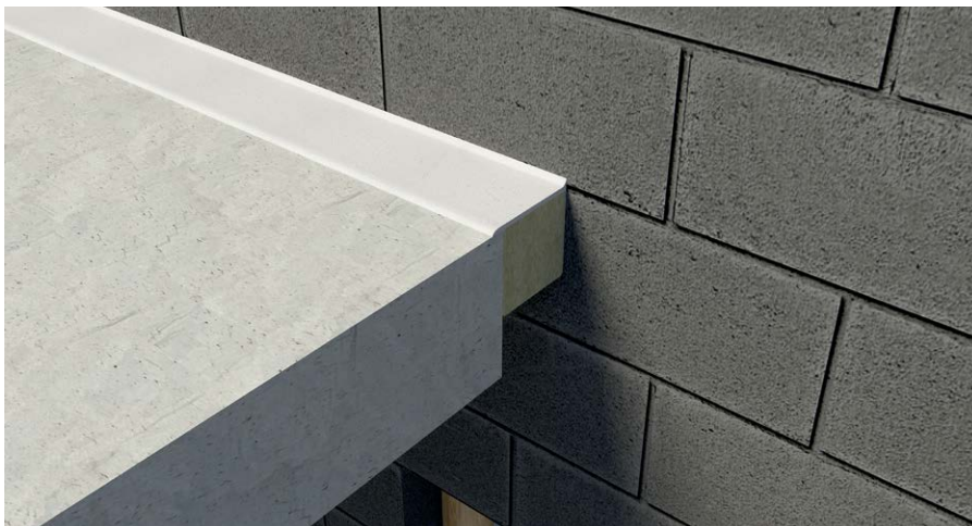
Linear joint seals