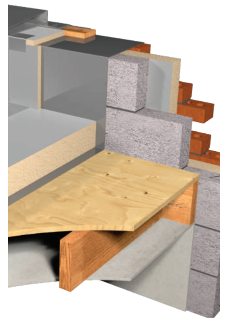
Flat roofs: MFR-GFR on timber deck